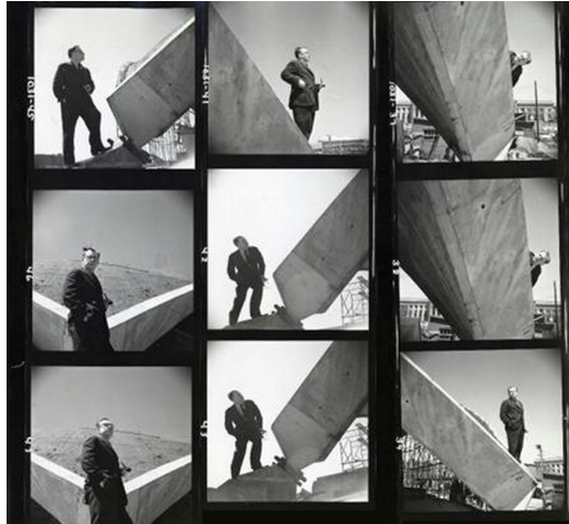
Figure 3: Saarinen posing with one of the supports of Kresge Auditorium for Harper’s Bazaar (Yale University Library / Eero Saarinen Collection Manuscript and Archives / MS 593 / Box 168 / Folder 503).

However, at its dedication in 1955, the building is deemed a rousing success, and is heralded for its impact on the campus and on the architecture world more broadly. Immediately after the opening, publicity and interest in the structure are widespread and almost unanimously supportive. Project 5007, as it is referred to within the Saarinen office, garners nicknames such as the “Opal on the Charles” (Weeks 1955), and descriptions like “Concrete Has Spread across the Sky” (Handy 1955). Saarinen declaratively predicts, “We are very much in the beginning of a whole new period of architecture” (Handy 1955). His standing as the public face of modern American architecture solidifies, and he is featured in magazines like Vogue (Saarinen 1955); Figure 3 shows a series of photographs of Saarinen taken next to Kresge by Harper’s Bazaar .